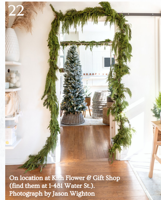
On location at Kith Flower & Gift Shop (find them at 1-481 Water St.).